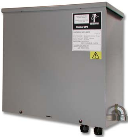
Note: shown with optional liquid-tight cable glands