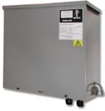
Note: shown with optional liquid-tight cable glands

Outdoor UPS with dc output and wide temperature batteries