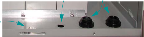
swivel out flange for attaching a seal or padlock once lid is closed