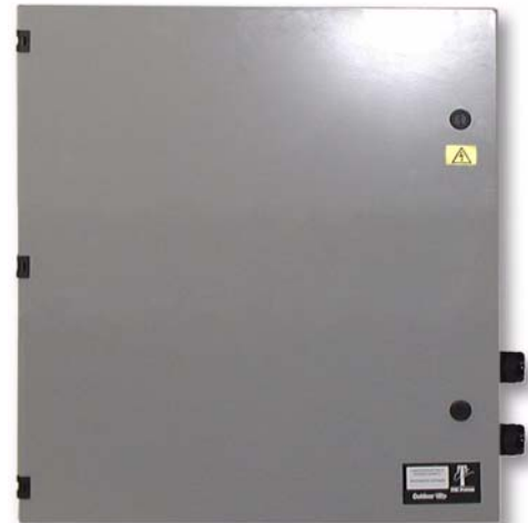
Note: shown with optional liquid-tight cable glands

For OEMs, a small 'hotel' space is provided inside the unit for your equipment to reside.