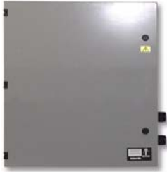
Note: shown with optional liquid-tight cable glands