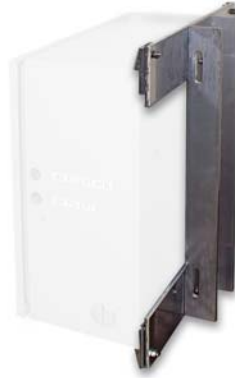
optional bandable or boltable monopole mounting brackets