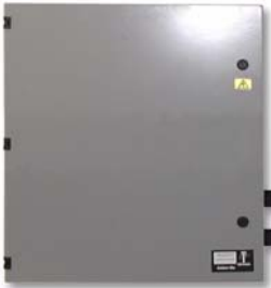
Note: shown with optional liquid-tight cable glands

Outdoor UPS with dc output, a wide ac voltage input window and wide temperature batteries