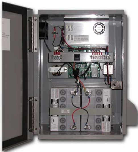
Plate 3. Interior view of an Outdoor-DcUPS-8229 with output of 12 vdc, and 10 amperes maximum output