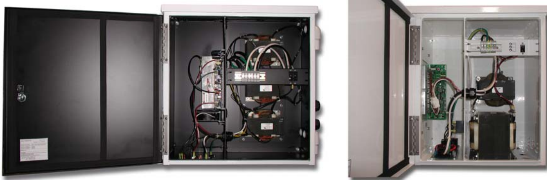
Plate 2. Interior views of two Outdoor VRp-ILc units (precision PWM voltage regulators with isolation transformer line conditioning)

TSi's designs its own power conversion systems to very rigid specifications and very broad component tolerances, thereby reducing the risk of failure and increasing the range of environments in which the systems can be used. The systems are specifically ruggedized with heavier components and proprietary coatings to eliminate the danger from moisture, salt, and other contaminants. The system is then assembled by TSi's experienced workers. The hardware and fasteners used are corrosion resistant. Ventilation is accomplished in such a way as to minimize ingress of water, dust, and other unwanted objects. All gaps are carefully sealed, and the completed unit is rigorously tested. TSi maintains testing records for certification and, if required, independent third party testing may be conducted.