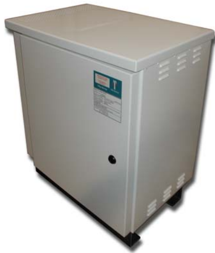
Plate 1. An outdoor VRp-ILc unit (precision PWM voltage regulator with isolation transformer power conditioning) with pad mounting 'feet.'