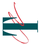
Figure 2 - An Example of a Global Outdoor UPS System with Protection