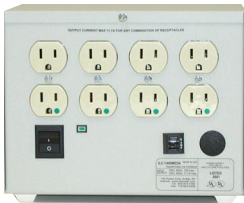
Rear View ILC-1400Med4