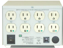
Rear View ILC-1000Med4