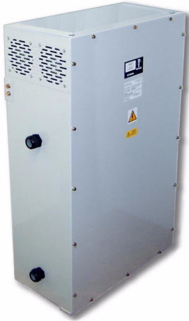
Left-Side Front View

TSi's ongoing product improvement process makes specifications subject to change. Other companies product names herein are for identification purposes only, and may be trademarks of their respective companies.