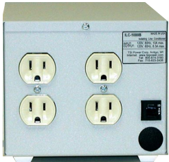
Rear View ILc-1000B